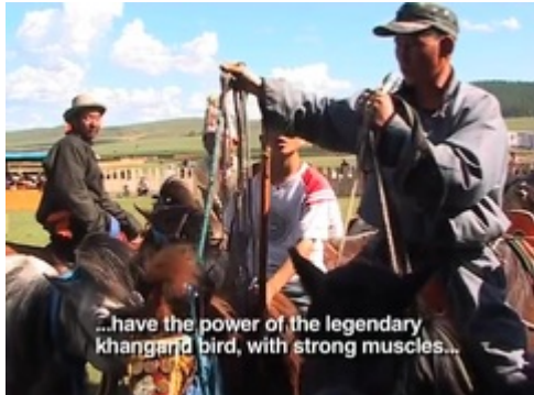
...have the power of the legendary khangan bird, with strong muscles...