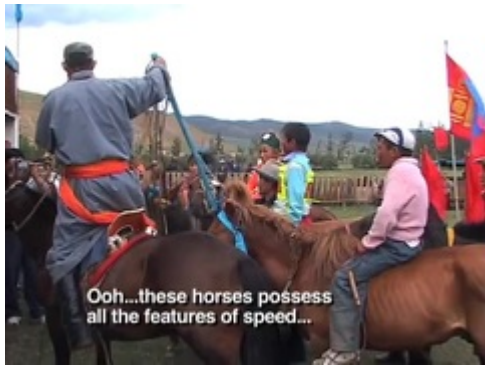
Ooh...these horses possess all the features of speed...