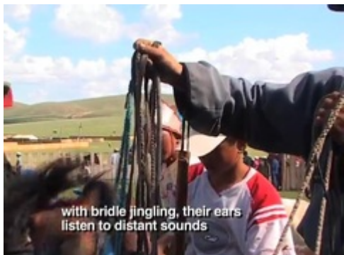
with bridle jingling, their ears listen to distant sounds