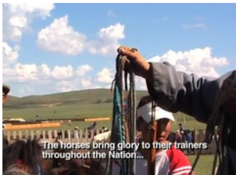
The horses bring glory to their trainers throughout the Nation...