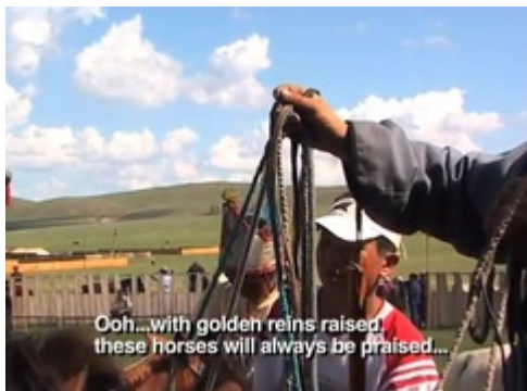
Ooh...with golden reins raised, these horses will always be praised...