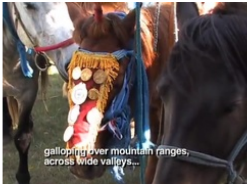
galloping over mountain ranges, across wide valleys...