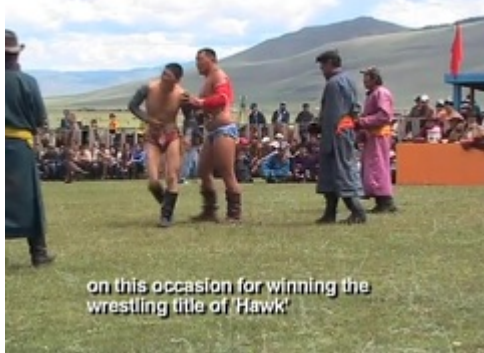
on this occasion for winning the wrestling title of 'Hawk'