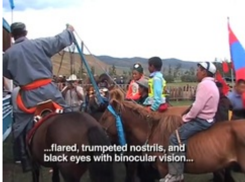
...flared, trumpeted nostrils, and black eyes with binocular vision...