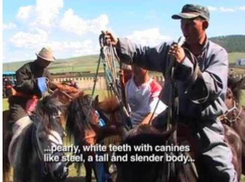
...pearly, white teeth with canines like steel, a tall and slender body...