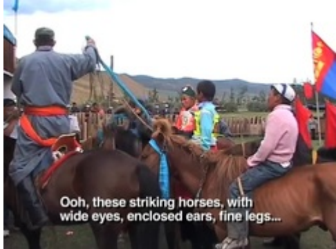
Ooh, these striking horses, with wide eyes, enclosed ears, fine legs...