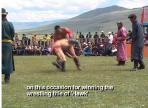
on this occasion for winning the wrestling title of 'Hawk'