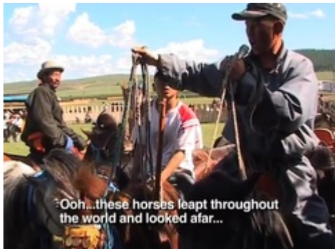
Ooh...these horses leapt throughout the world and looked afar...