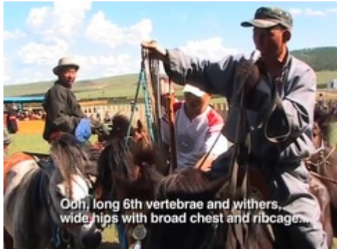
Ooh, long 6th vertebrae and withers, wide hips with broad chest and ribcage...