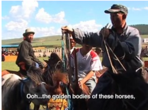
Ooh...the golden bodies of these horses,