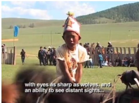
with eyes as sharp as wolves, and an ability to see distant sights...